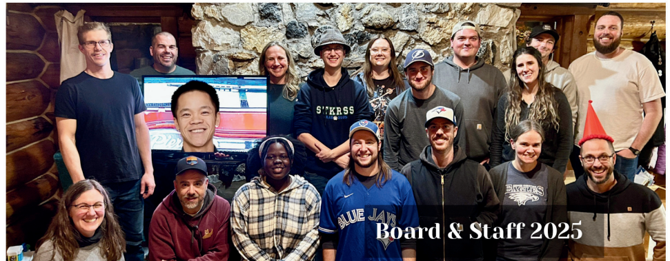
Board & Staff 2025